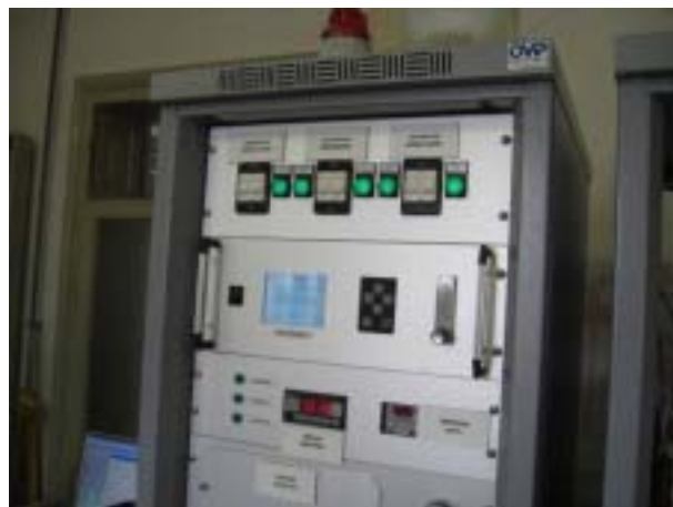
Biogas monitoring system in Belgium