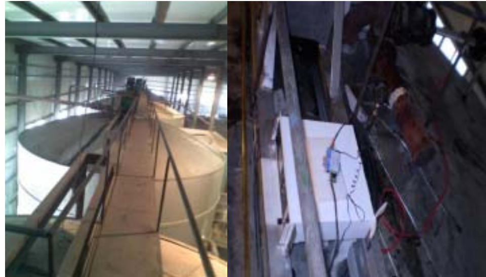
Waste Anaerobic Digestion