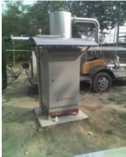
Landfill Gas Monitoring in Beijing